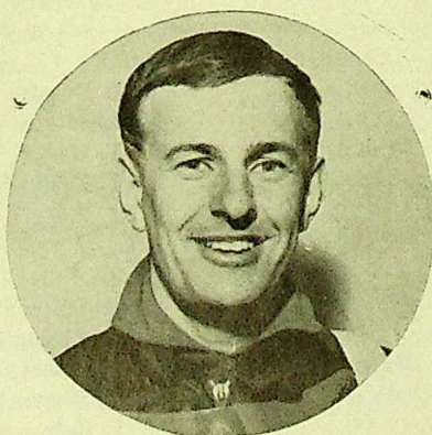
Bjorn Knutsson. World Champion. We are awaiting confirmation of the Swedish Star's acceptance.