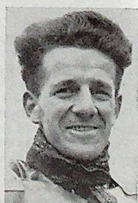
NEIL STREET Exeter