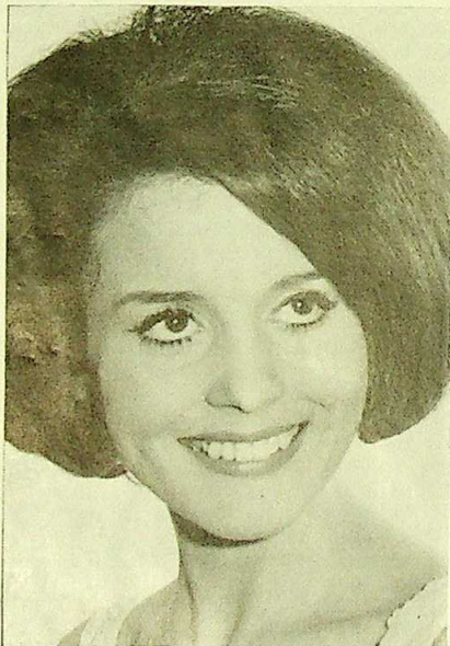
Our Special Guest this evening, charming, talented singing star, JULIE ROGERS. WELCOME to West Ham MISS JULIE!

So the World Final picture is gradually falling into shape. Only five weeks to go before the six British and ten Continentals clash at Wembley to decide who will wear the World Championship crown!